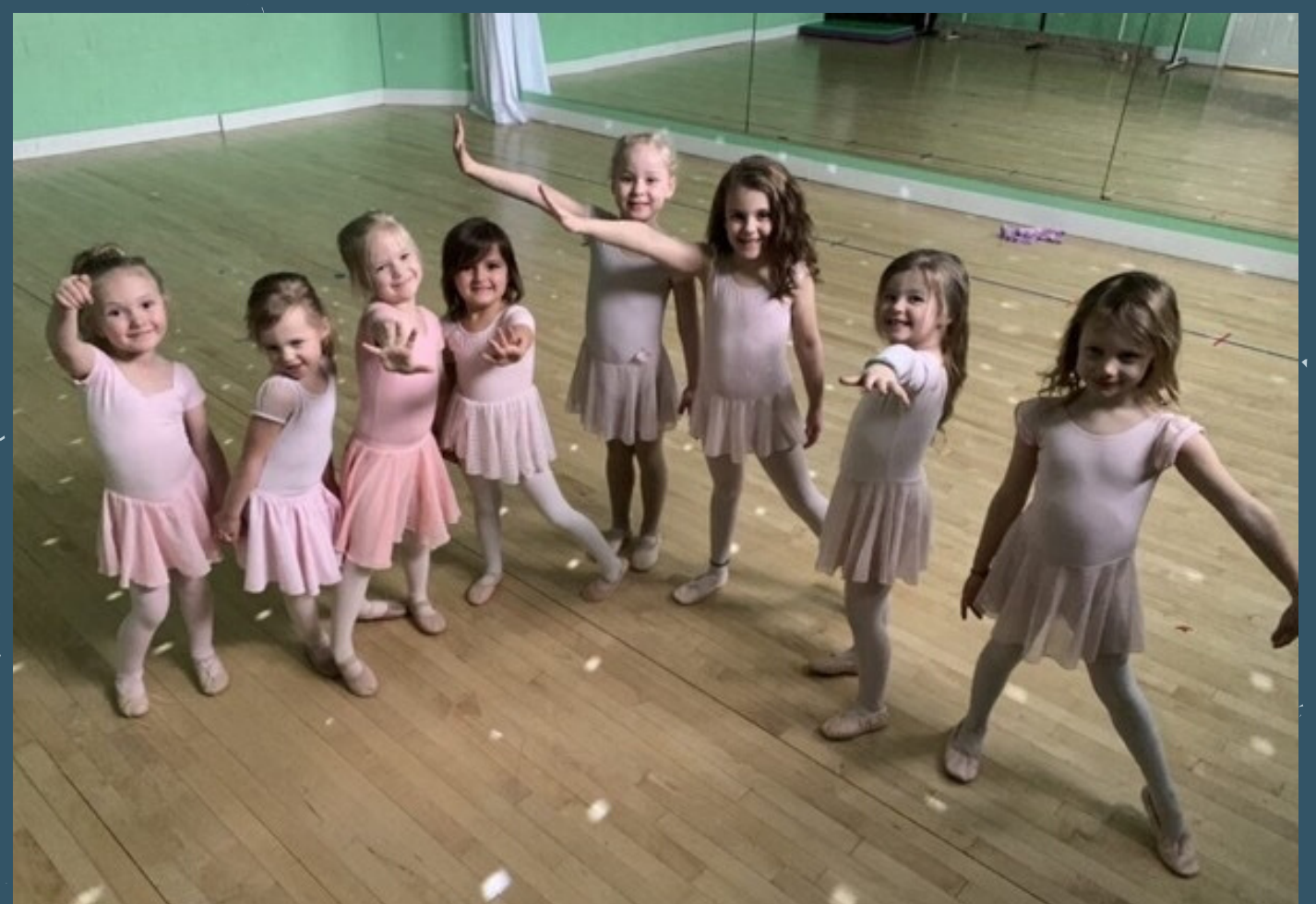
Ms. Skylar's Pre-Ballet/Tap N jamming out to Frozen in early March!