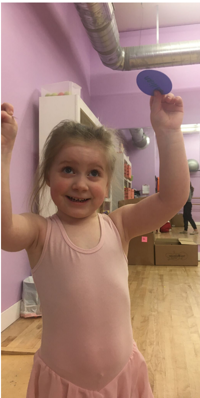
LILLIAN BUDDING BALLERINAS