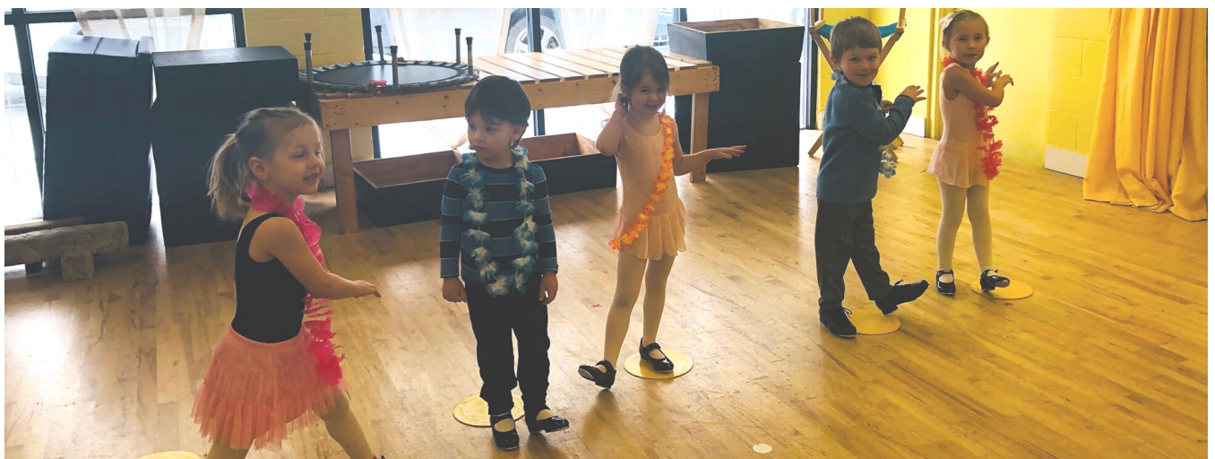
Ms. Katie's Tap Puppies learning Hula in preparation for Beach Week

Come see what we've been working on in class! Black Folders, which contain all the information you'll need to know about rehearsals, recital, and picture day will be going home this week.