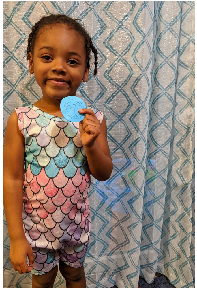
PAISLEY TUMBLING TYKES N