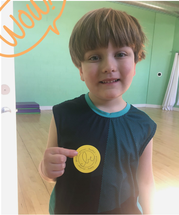
CULLEN BOYS HIP HOP 1