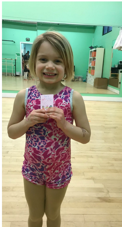
NATALIE TUMBLING TYKES N