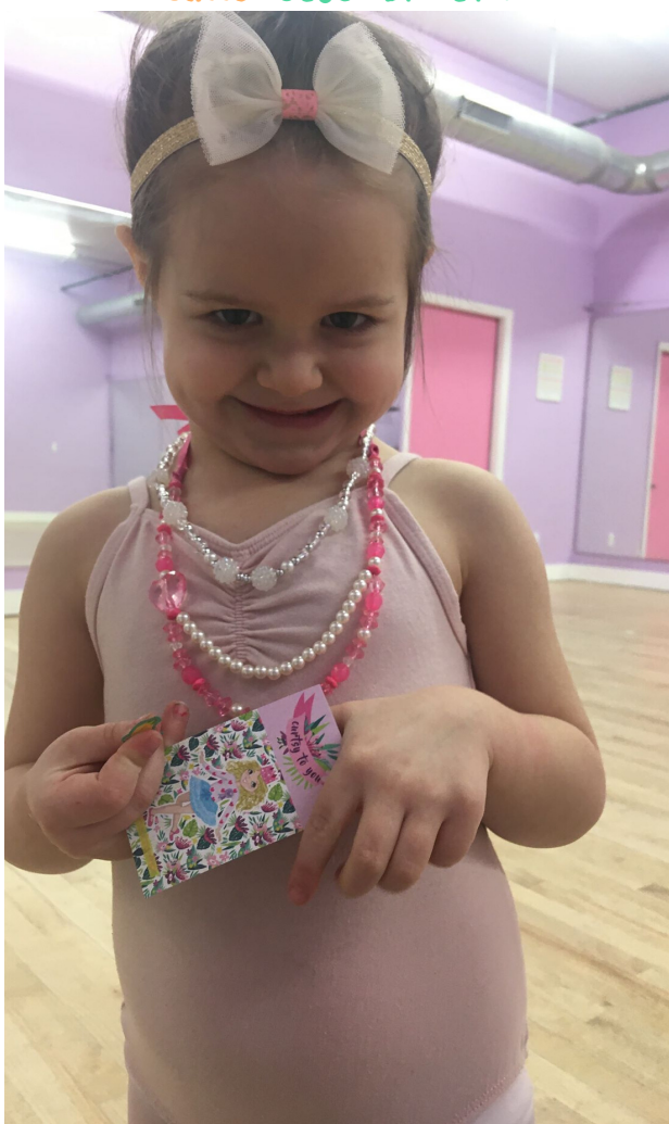
ELLYN BUDDING BALLERINAS