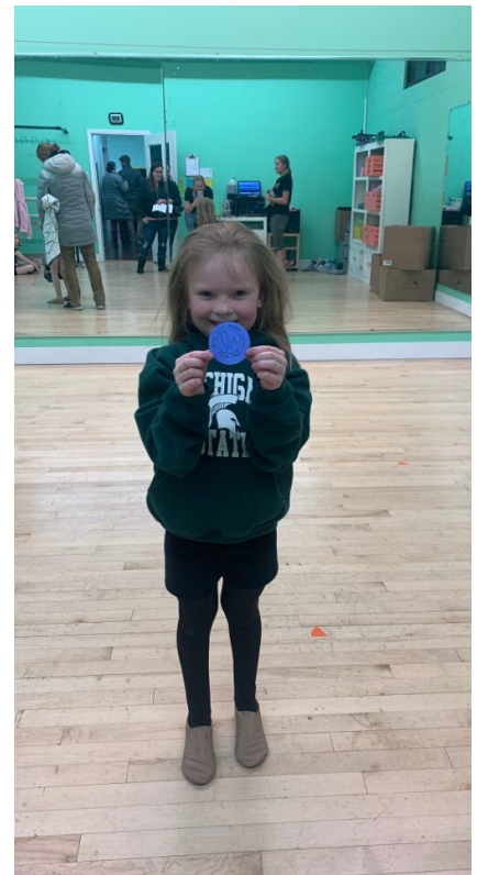
BRI PRE-BALLET/JAZZ N